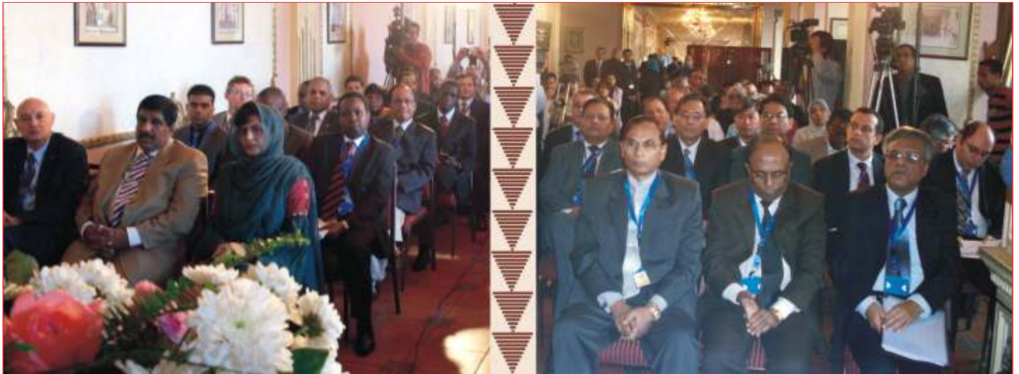
12 th Governing Council Meeting in progress

(Contd. from Page 1 - 12 th GC Meeting, Cairo, Egypt)