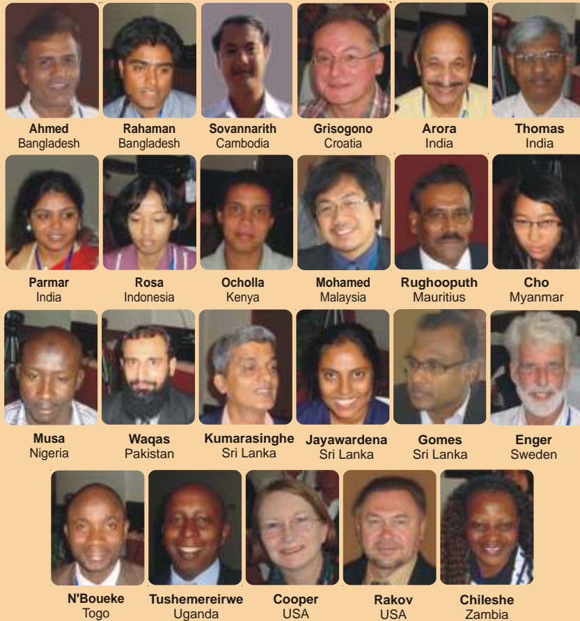
Foreign Co-Chairs and Speakers of Lightning Symposium, Kathmandu, Nepal

(Contd. from Page 1 - Lightning Symposium, Kathmandu, Nepal)