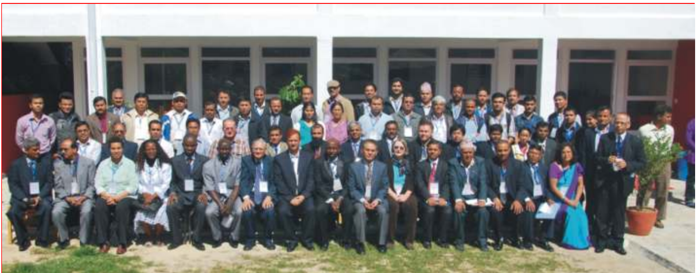
Group Photo of Lightning Protection Symposium, Kathmandu, Nepal

The participants thanked the organisers for the successful and fruitful organisation of the Symposium and for excellent hospitality and arrangements made for the delegates, and unanimously hoped that more similar events will be held in future with a focus on South-South cooperation.