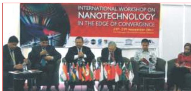
Inauguration of Nanotechnology Workshop, Malaysia

With a view to providing a forum for the academicians, scientists and researchers active in