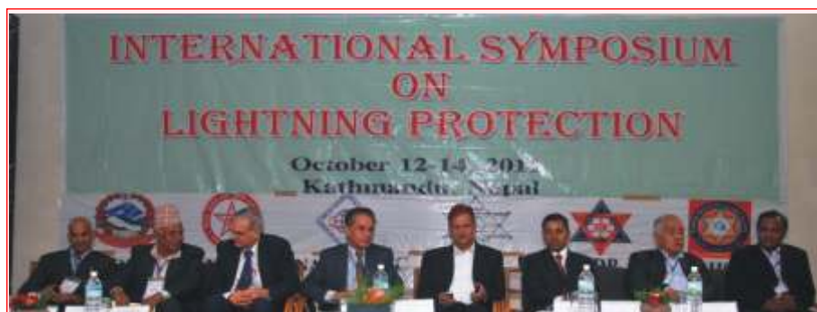
Inauguration of Lightning Protection symposium, Kathmandu, Nepal

Lightning is a most dramatic and most common natural activity that occurs in the atmosphere. Lightning strikes may cause severe damage to physical structures and claim human and animal lives. It may ignite fires that may bring an entire structure down to ashes or create cracks, and at a lower degree of damage, it may destroy electrical, electronic and communication equipment beyond repair. Transmission and