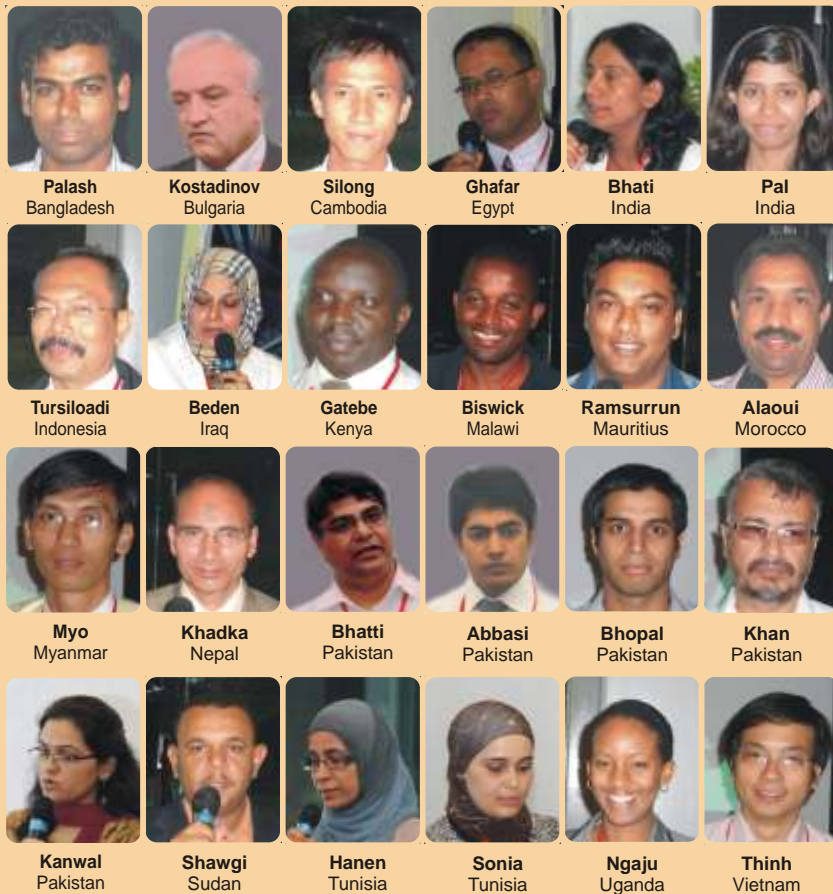
Foreign Co-Chairs and Speakers of Nanotechnology Workshop, Malaysia

(Contd. from Page 1 - Nanotechnology Workshop, Malaysia)