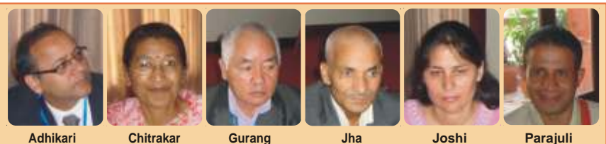
Nepalese Co-Chairs and Speakers of Lightning Symposium, Kathmandu, Nepal