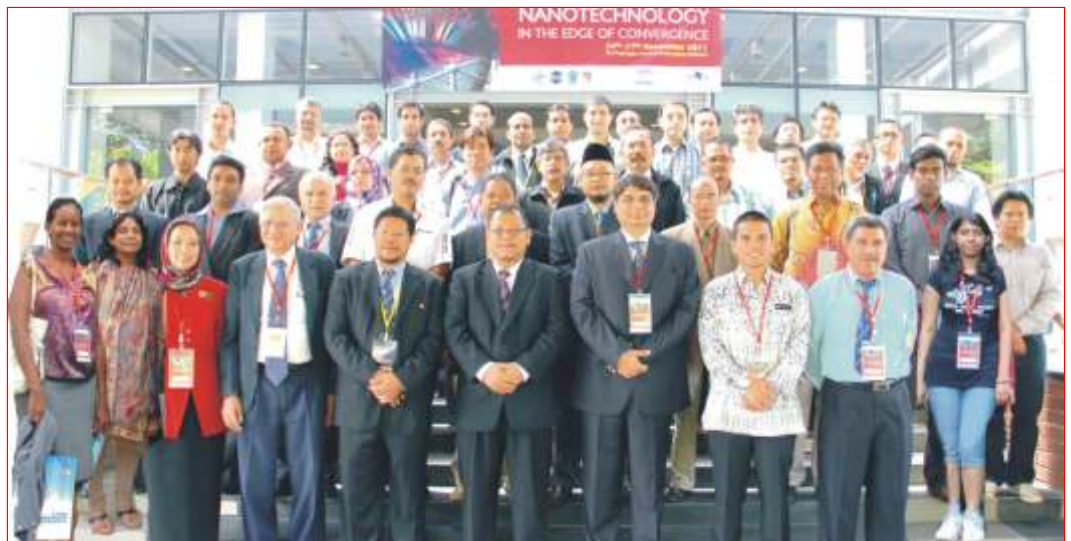
Group Photo of Nanotechnology Workshop , Malaysia